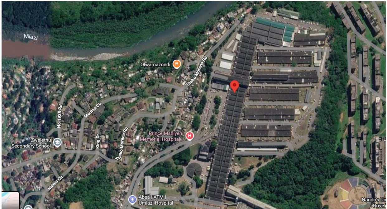
Figure 3: Prince Mshiyeni Precinct